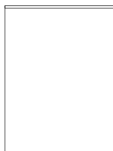
300 x 400 cm