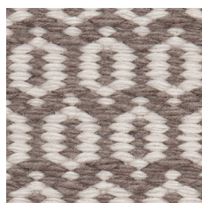
CR | LG