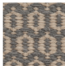
TT | GG