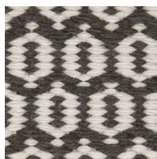
CR | TL