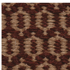
BR | B