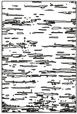
200 x 300 cm