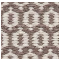
CR | LG