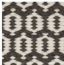
CR | TL