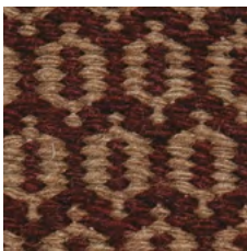
BR | B