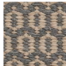
TT | GG