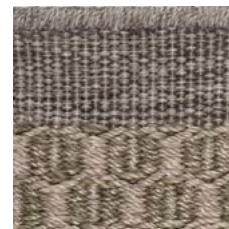
SA | SG | AS