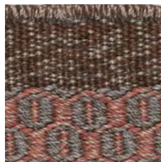
BK | AS | MB