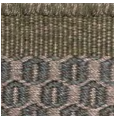
SI | TG | SG