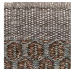
SE | RU | SI