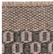
DG | EG | LB