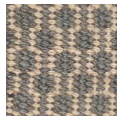
TT | GG