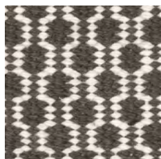
CR | TL