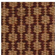
BR | B