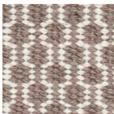
CR | LG